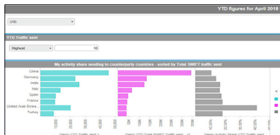
Trade Finance dashboard