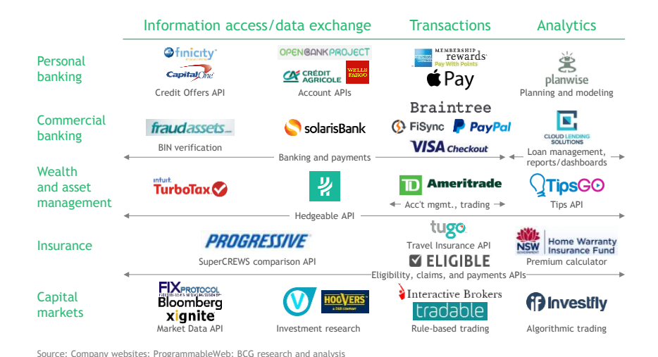
Exhibit 1: Open banking strategies and products (APIs) are proliferating across all sectors in financial services

Characteristics & trends in the securities servicing make API adoption attractive: