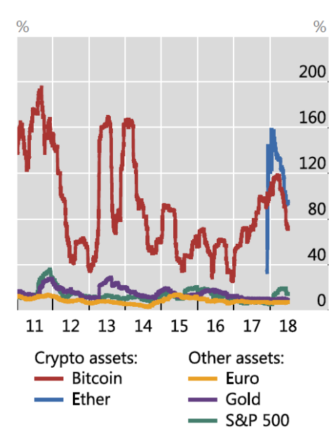
Chart 2: Price Volatility