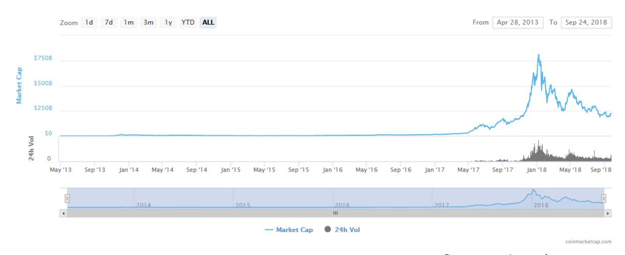
Chart 3: Total Market Capitalization