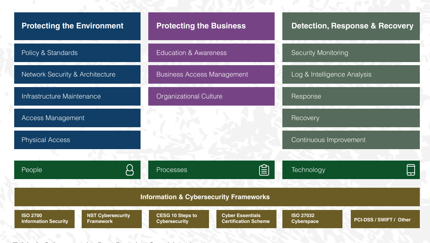
Table 1: Cybersecurity Best Practice Considerations

As attackers begin to understand banks' internal processes and infrastructure, it is clear that they are becoming more dangerous. As such, there is a greater need for financial institutions to take steps to protect their key systems and gateways.