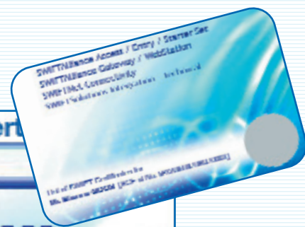
SWIFT-Certified Experts badge samples