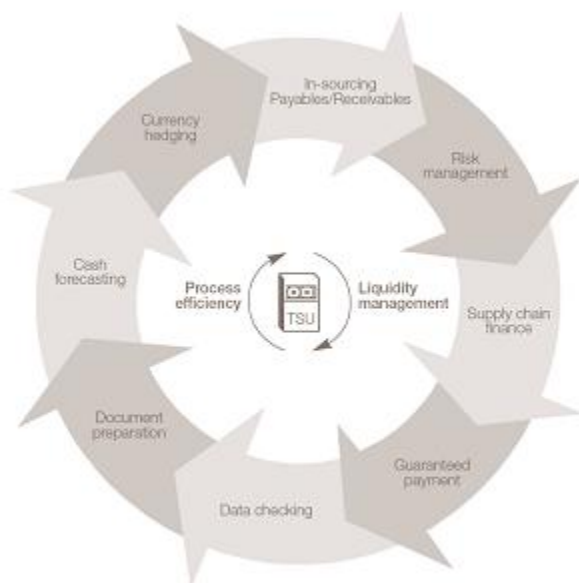
● Banks Services based on the TSU

The TSU is a collaborative, centralised matching and workflow engine for use by the SWIFT Banking Community. It is designed to help banks provide competitive supply chain services to their corporate customers. It builds on SWIFT's traditional strengths in providing standards and messaging, and reuses the SWIFT infrastructure already in place in banks' back-offices. All communication is Bank to TSU or TSU to Bank.